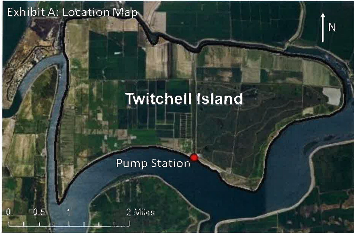
Exhibit A: Location Map